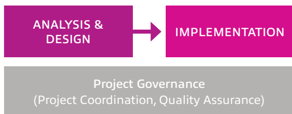
Diagram: Insight's 2-phase approach for Azure Data Services Foundations

Our two-phase approach incorporates an assessment and design phase to ensure your business and data requirements are well understood, prior to executing the implementation phase.