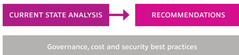
Diagram: Insight's 2-phase Azure best practice review approach

During this engagement we will collate the information and findings of your current challenges and work with you to discuss opportunities for optimisation in an interactive follow-up Q&A session.